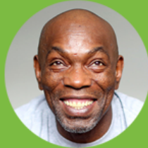
RICKEY JACKSON FILM SUBJECT

After the screening, stay for a panel discussion tackling the profound issue of injustice and wrongful convictions within the American legal system.