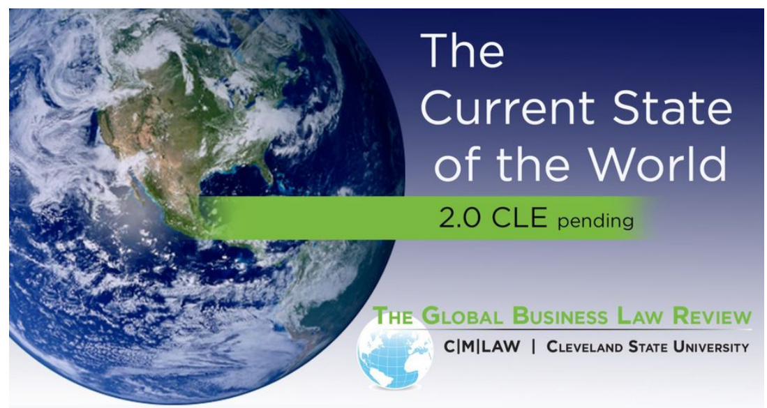
Global Business Law Review Event

Friday, November 20 | 11:00 a.m. - 2:00 p.m. The Current State of the World Webinar